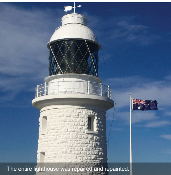
The entire lighthouse was repaired and repainted.

The Fosroc team worked with Dulux Protective Coatings and Emer to provide a complete project solution.