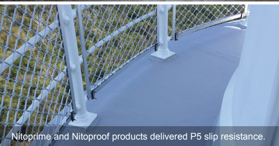
Nitoprime and Nitoproof products delivered P5 slip resistance.